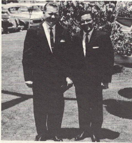
At Sydney airport before takeoff!