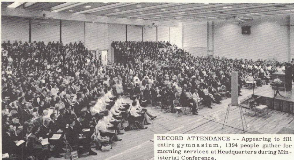
RECORD ATTENDANCE -- Appearing to fill entire gymnasium, 1394 people gather for morning services at Headquarters during Ministerial Conference.