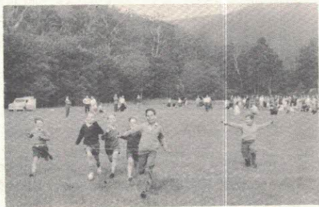
An exciting finish!

all returned with renewed energy to participate in a well organized program