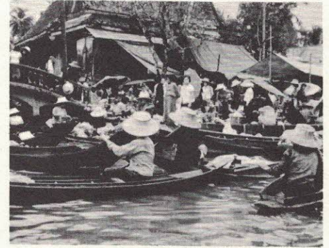
The Floating Market, Bangkok

worse though, the grinding poverty, the appalling lack of material sustenance, the heart-rending deformity, the sickening stench of disease and death, is passively accepted by most of the inhabitants.