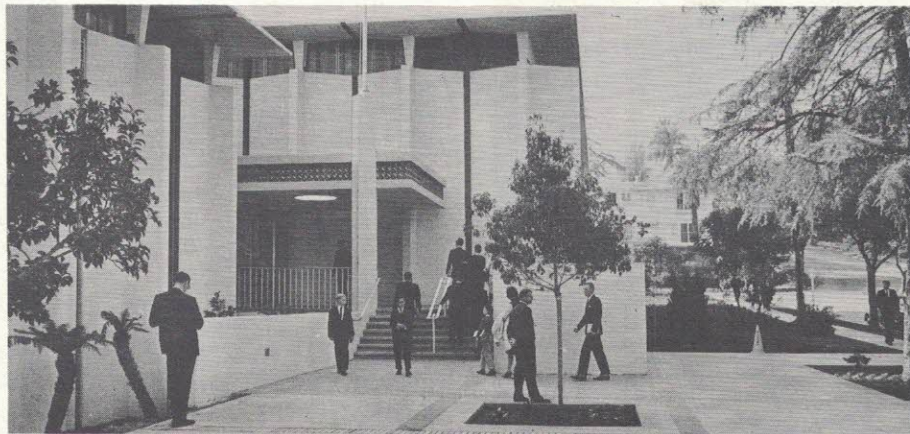
FRONT ENTRANCE -- Daylight view of magnificent main entrance to new gymnasium.

Mr. Cole with all the other ministers thought that it was a very successful conference. It was an inspiring occasion, as well as being profitable in helping solve many of the local problems and questions.