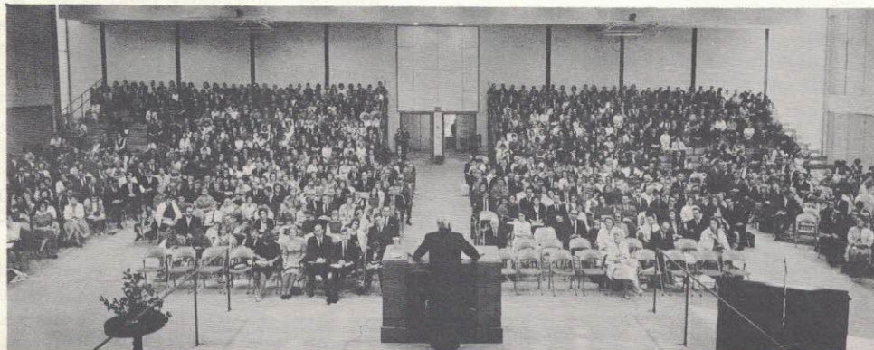
NEW HOME -- Mr. Herbert W. Armstrong making announcements to Headquarters congregation during historic first Sabbath service. It has been eight years since the Pasadena Church assembled on the Ambassador campus for regular services.

But, now God has supplied a new and larger meeting place for His Headquar-